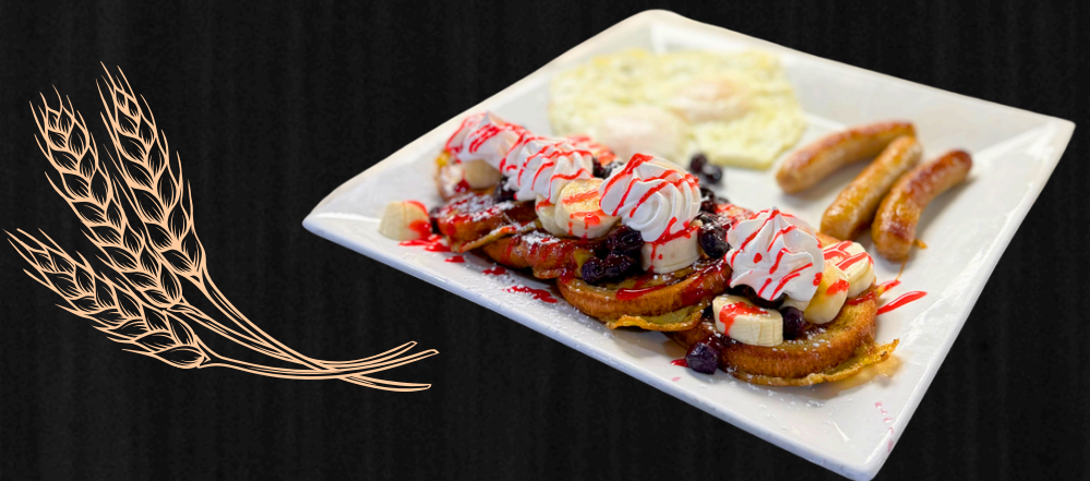
Cinnamon French Toast