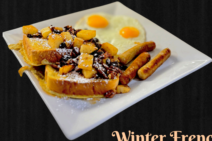
Winter French Toast

NEW! Cinnamon French Toast $12.45 -Topped with strawberries, bananas, whipped cream, and raspberry sauce.