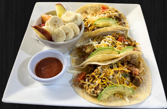
Chorizo Breakfast Tacos

-Scrambled egg, Chorizo, onion, avocado, cilantro, mozzarella and cheddar cheese. Served with a Fresh Fruit cup.